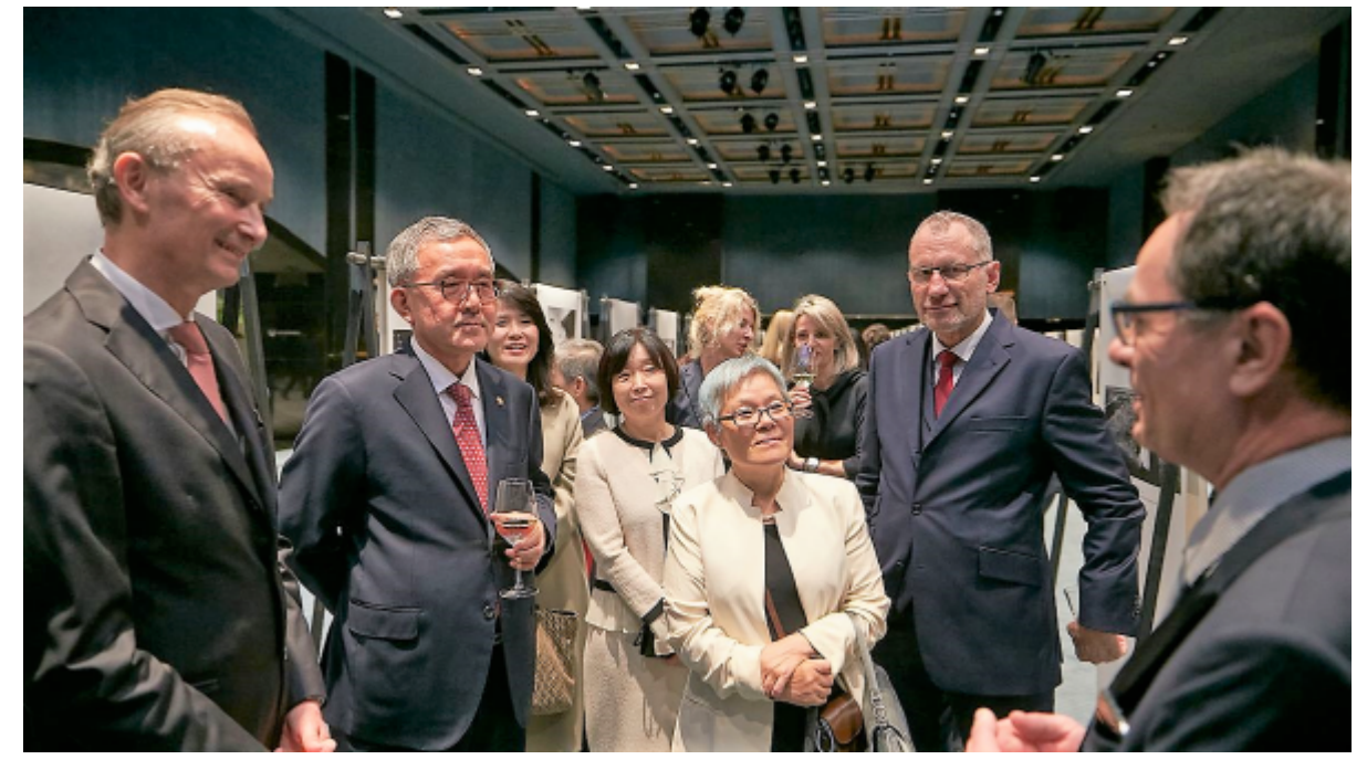
Ah the exhibition, titled "German Contemporary Excellence" held in Grand Salon, VIP guests observe highlight works and listen to the explanation of Gerhard Steidl.

It was one of the largest National Day functions hosted by the Ambassadors in Seoul. The partitions between two ballrooms were removed to turn into one huge hall the main Grand Ball Room, the Regency Ballroom and the large space between them. Reporters attending the function from The Korea Post media estimated the guests to total more than a thousand.